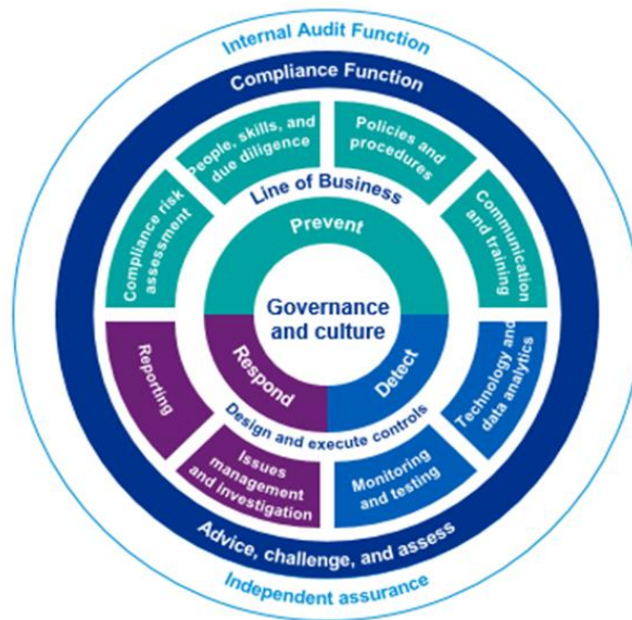
Illustration I: The Compliance Program of Tüpraş

Prevention is managed by Compliance risk assessments, due diligence practices, written policies and procedures as well as communication and trainings. Detection, is supported by technology and data analysis as well as monitoring, testing and audit practices. Response refers to investigations and reporting activities.